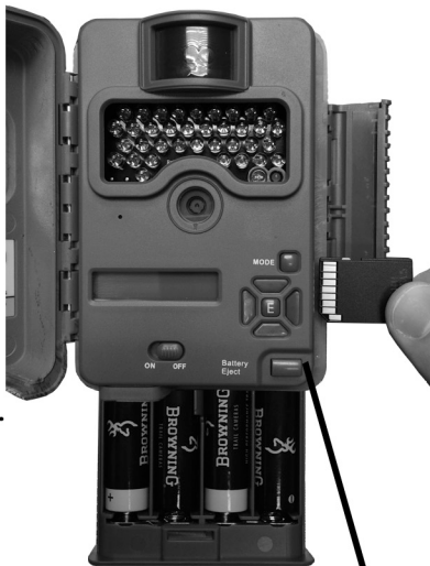
Battery Eject Button

Slide the battery tray into the closed position.